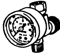
HAV-501 Air Valve